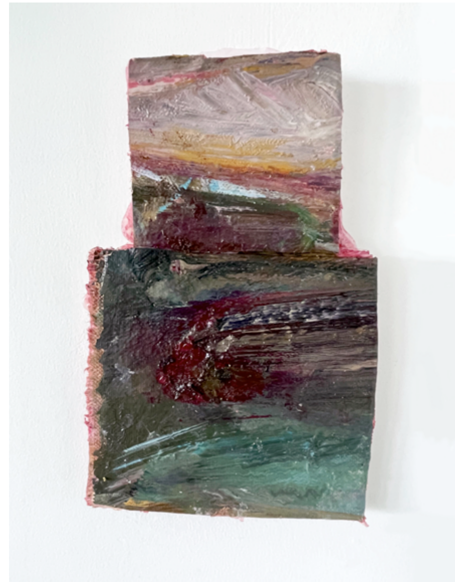
Light in Darkness , 2021, Oil and jade glue on canvas, 8" x 5"