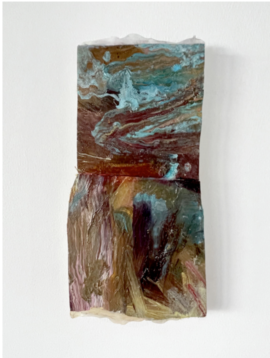
The Veils Are Thin 2 , 2021, Oil and jade glue on linen, 9" x 4.5"