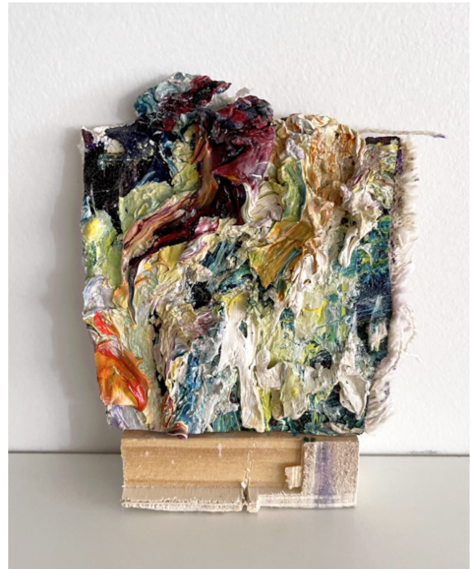
Second Beach , 2021, Oil on canvas and wood, 5" x 3.5"