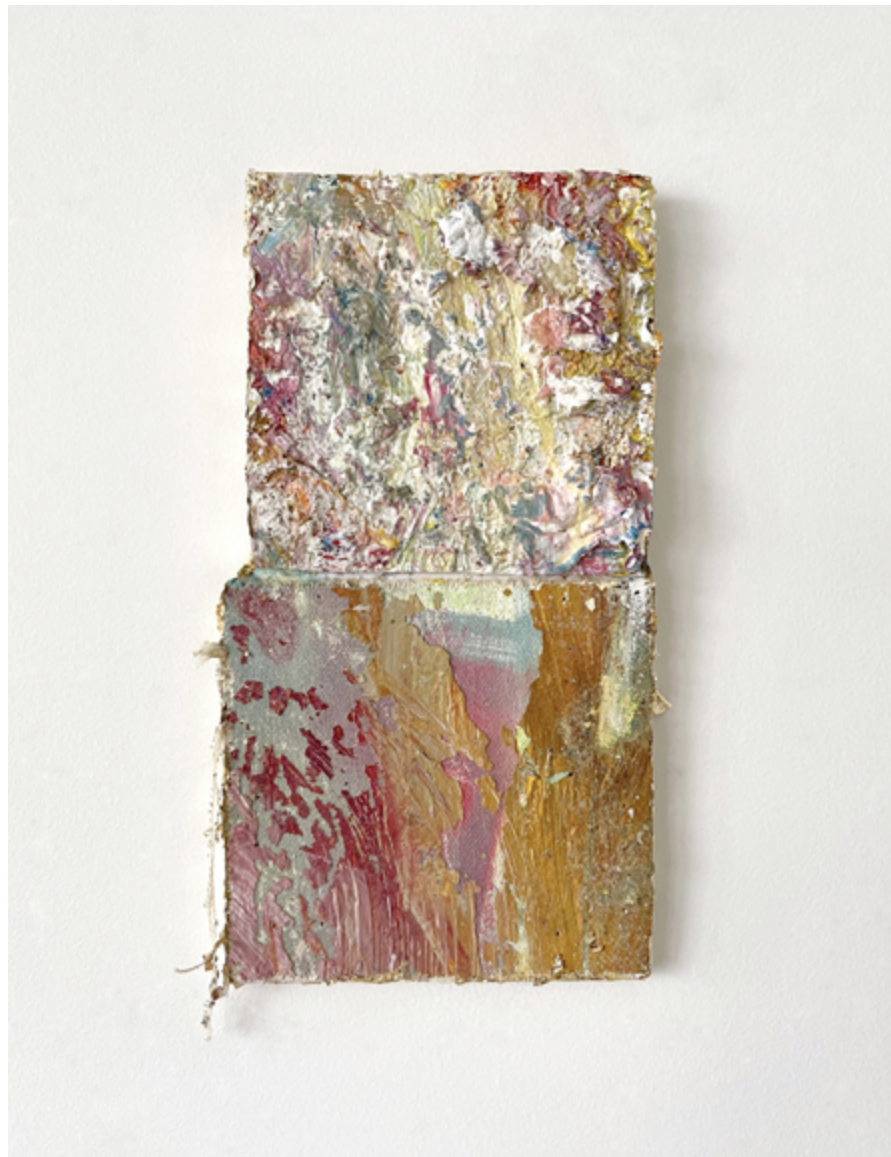
The Veils 2 , 2021, Oil on linen, 8" x 4"