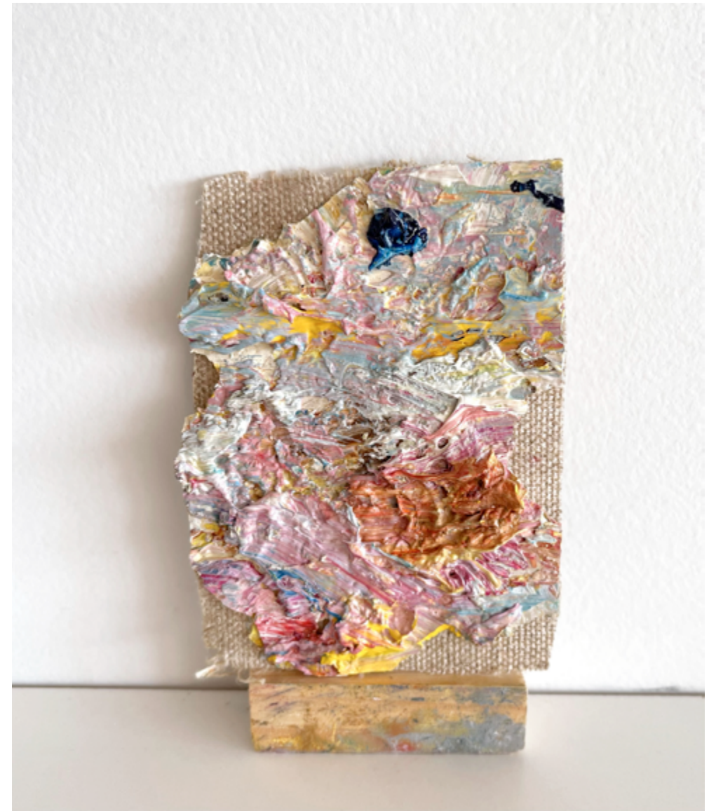
Dark Star , 2021, Oil on linen and wood, 4" x 3"