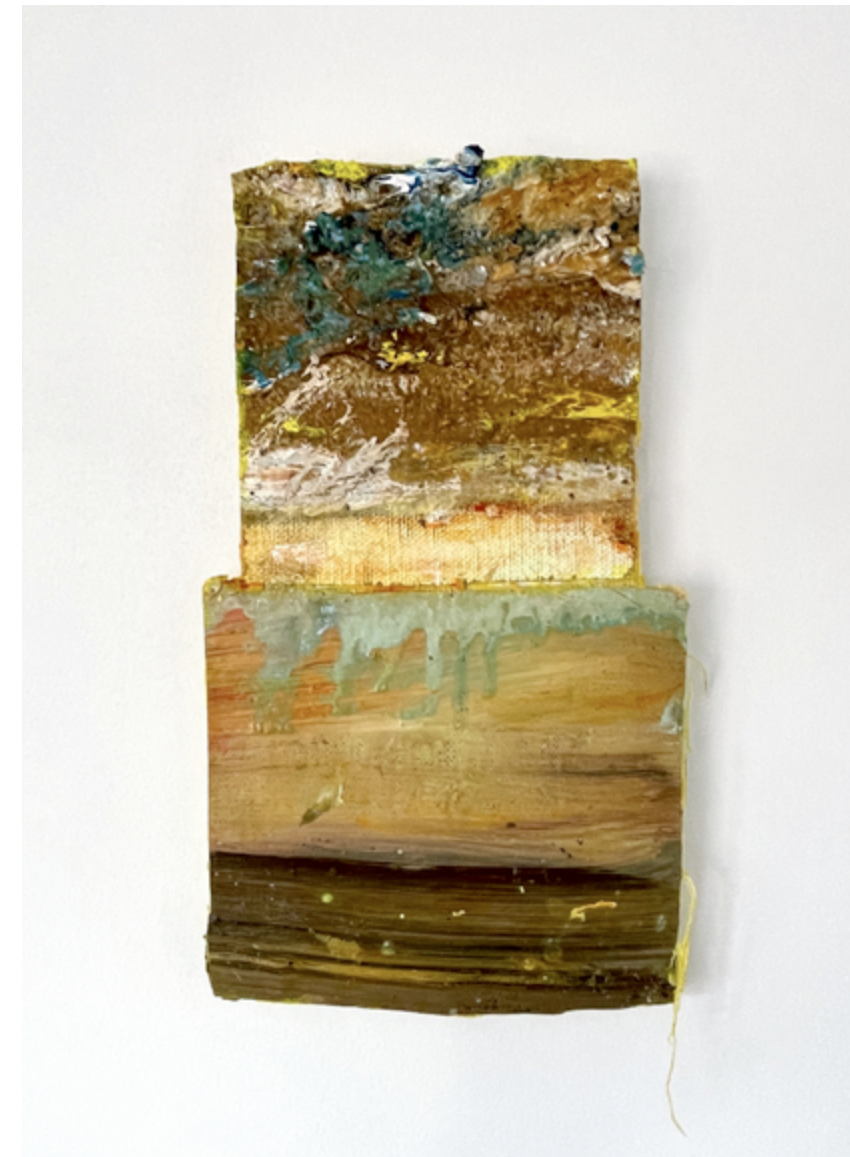
Morning , 2021, Oil on linen, 8" x 4.5"