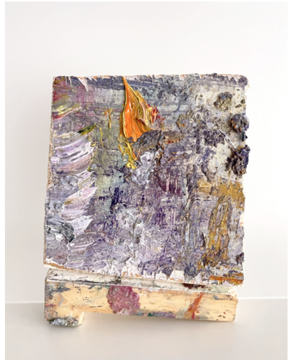
Orphic , 2021, Oil on panel, 4.75" x 3.75"