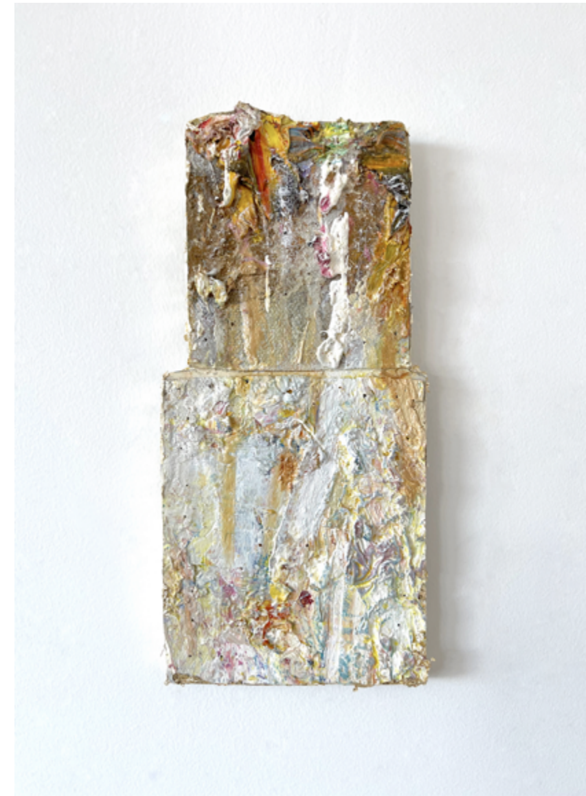
The Veils , 2021, Oil on linen, 12" x 5.5"