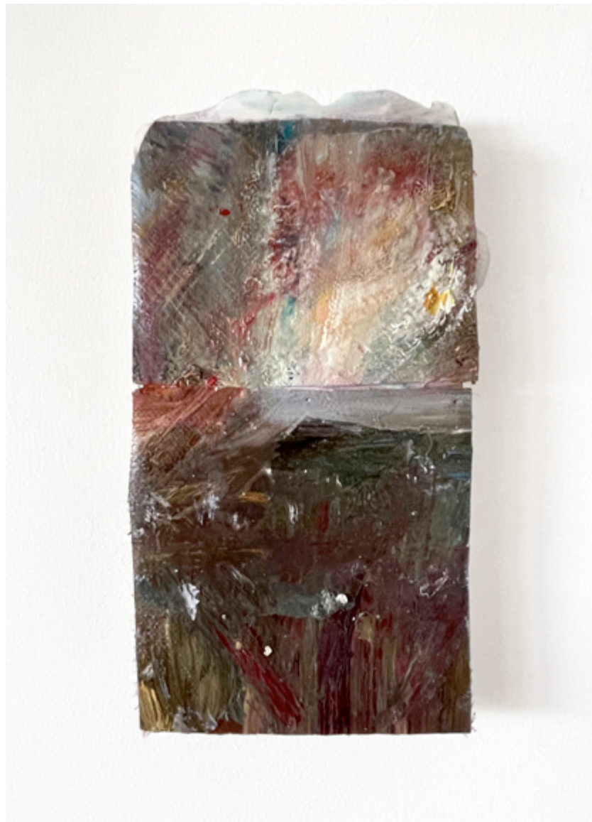
Misguided Angel Love You Till the Day I Die, 2021, Oil and jade glue on linen, 7" x 4"