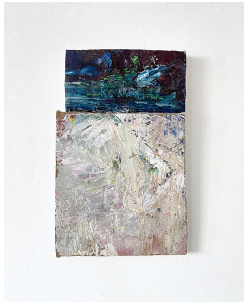
Morning Has Broken 2 , 2022, Oil on linen and panel, 8" x 6"