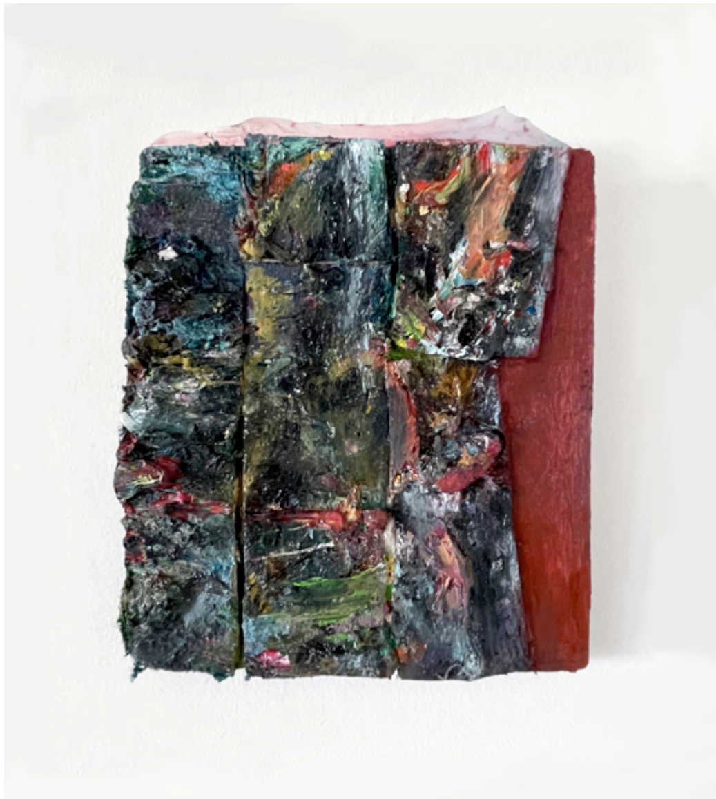
Pieced Together 1 , 2021, Oil and jade glue on linen and panel, 5" x 6"