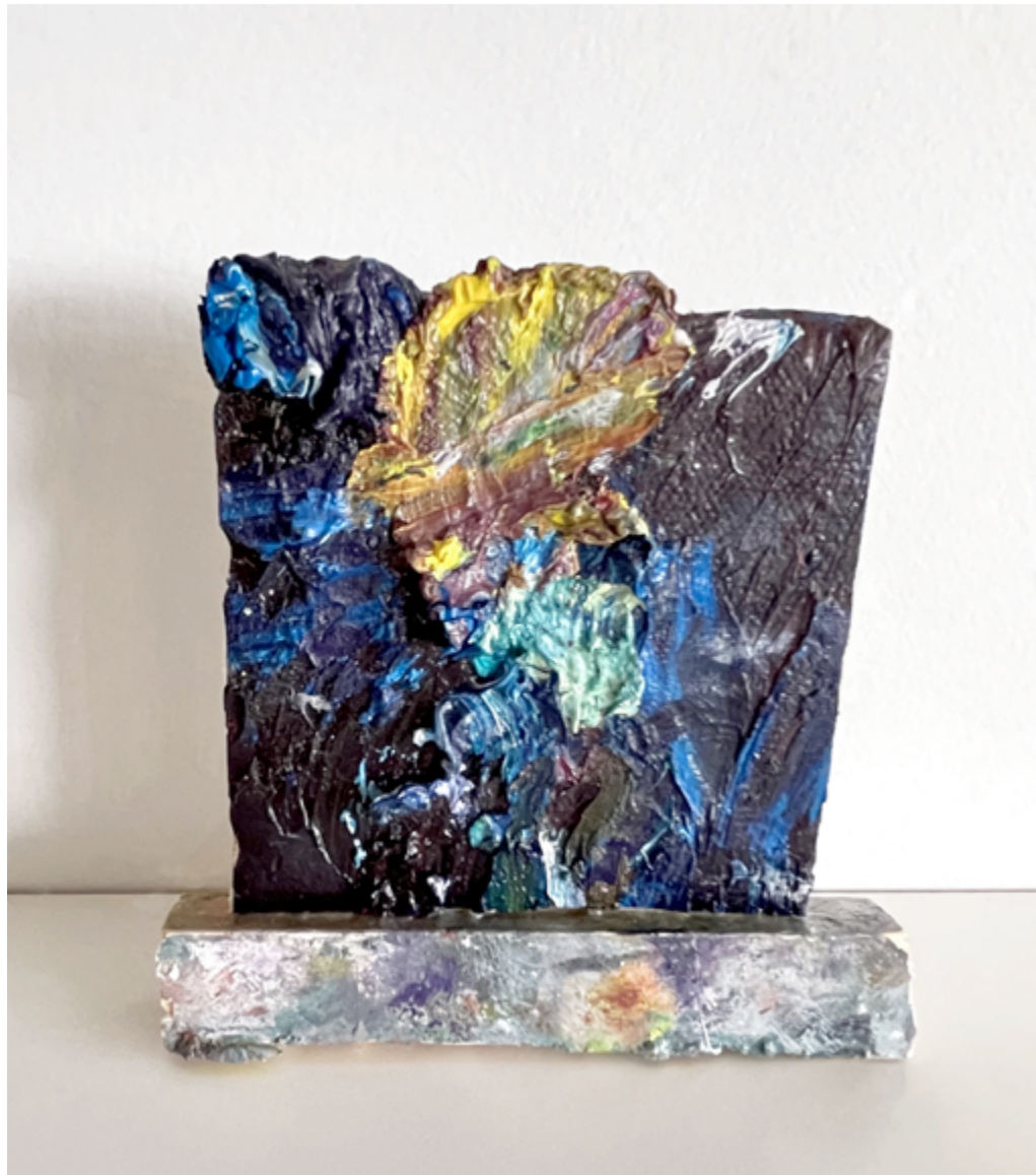
But Soft , 2021, Oil on panel, 4" x 4"