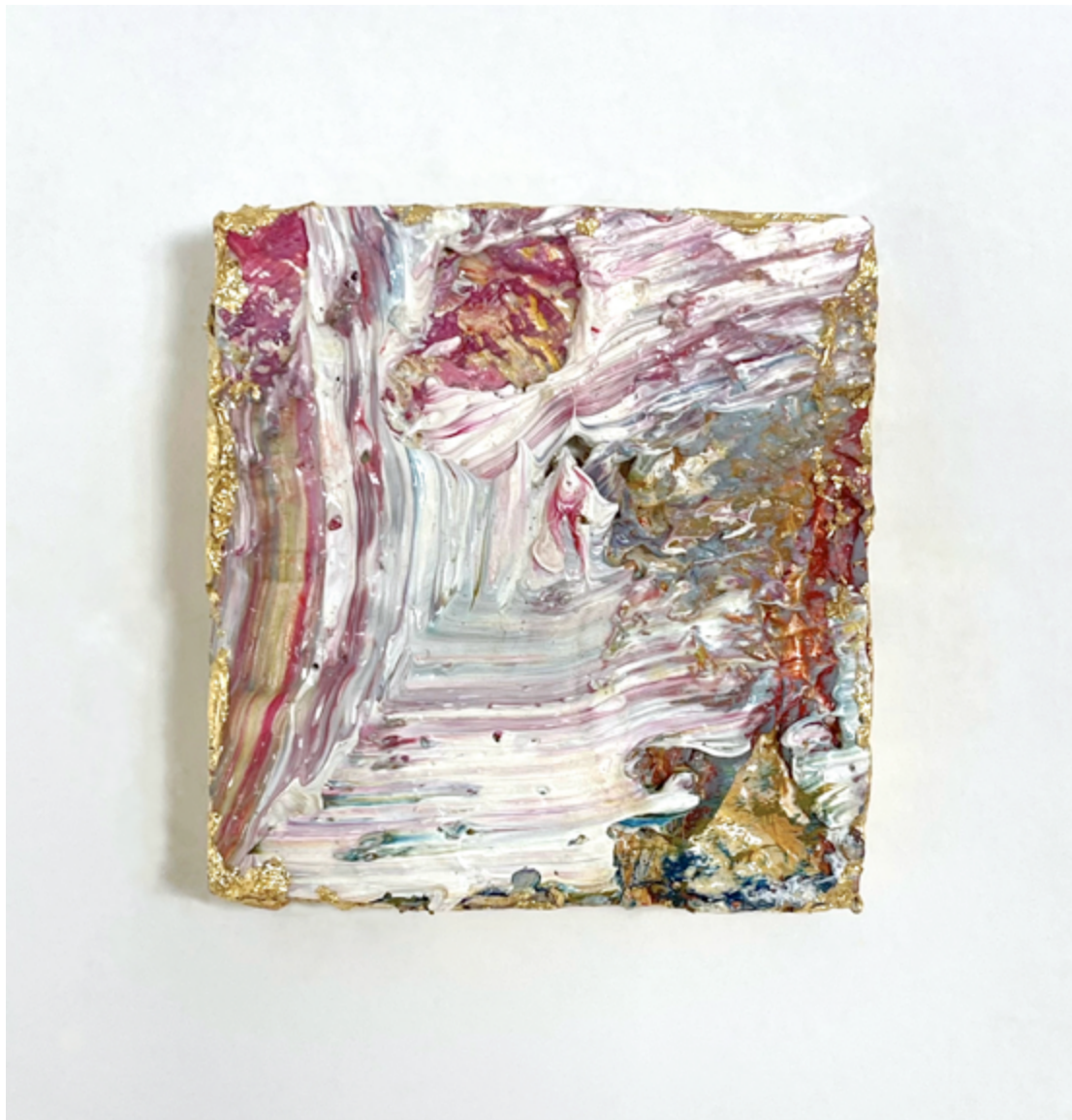
Saucers of Milk , 2021, Oil and gold leaf on linen, 2" x 1.75"