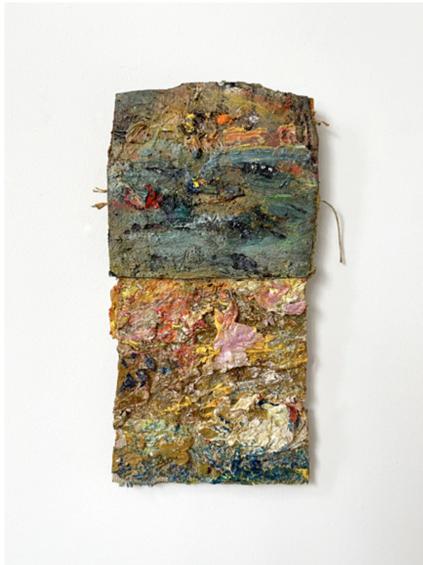
Darkness Travels at the Speed of Light , 2021, Oil on canvas, 7.5" x 4"