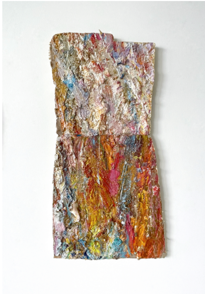
Dorothy's Dress , 2022, Oil on linen, 15" x 8"