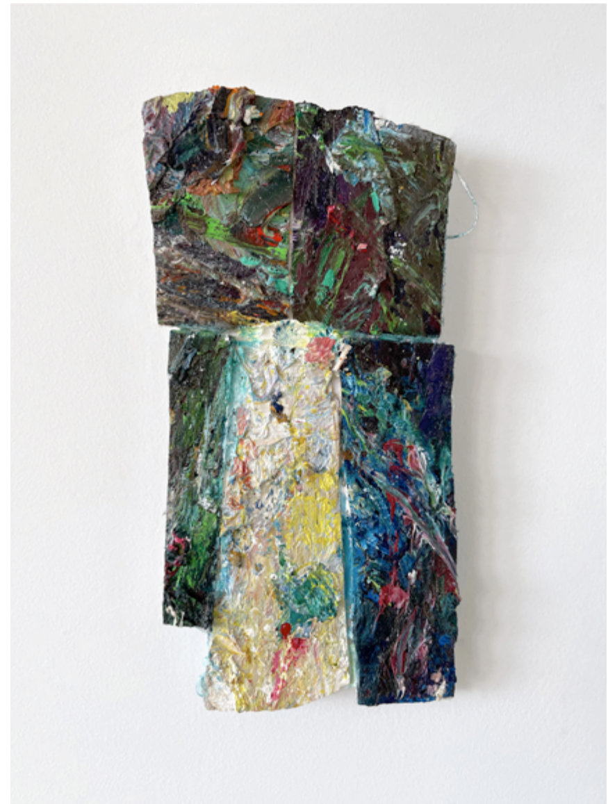
The Veils Are Thin , 2021, Oil on linen and panel, 9" x 4"