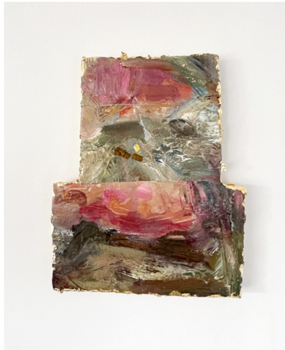
George , 2021, Oil and gold leaf on canvas, 7.5" x 6"