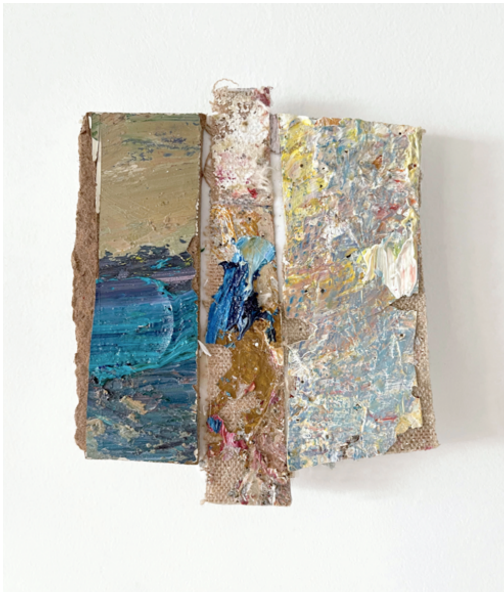
Morning Has Broken , 2022, Oil on linen and panel, 5" x 4"