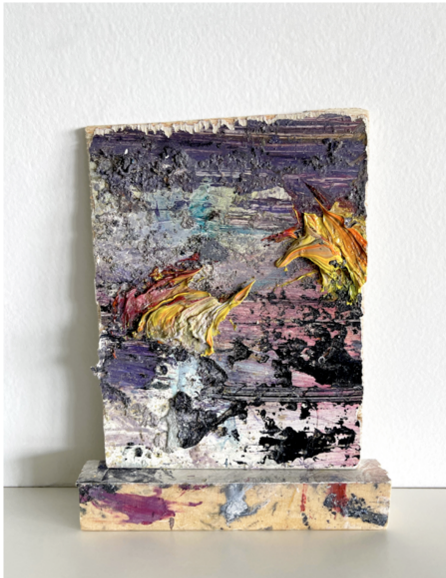
Abadiania 2 , 2021, Oil on panel, 5" x 3"