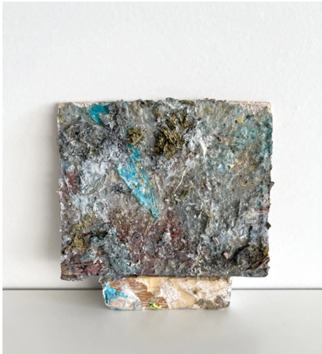
Abadiania , 2021, Oil and silver leaf on panel, 3.5" x 4"